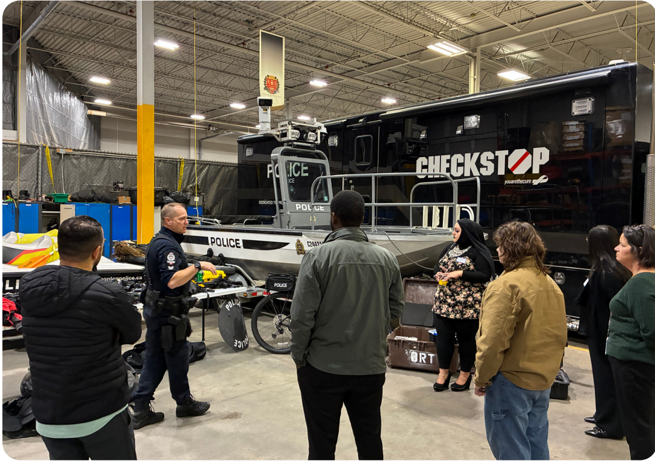
Council members at the IOF symposium

Active director of EIRC (Edmonton Islamic Resource center). I play a crucial role in overseeing the organization's direction, governance, and impact of the organization. I participate in planning fostering relationships involving settlements of new families and providing resources.