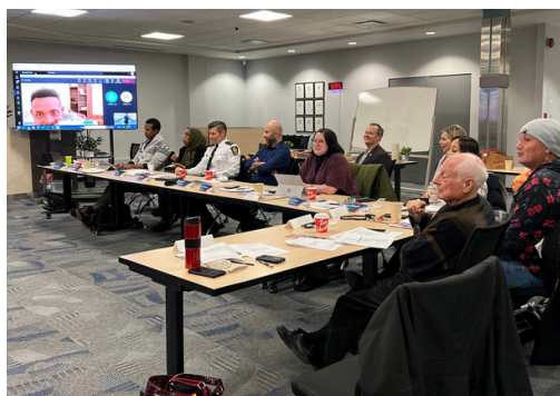
Members of the CCC in discussion at a 2023 meeting.