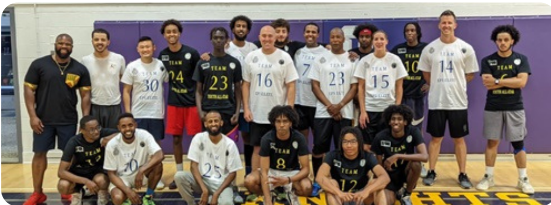
EPS Blues play Queen E in a game of basketball