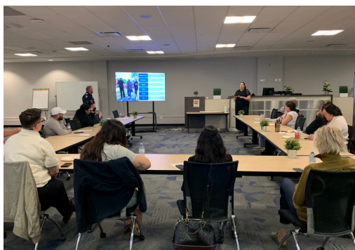
Council members at the HELP unit